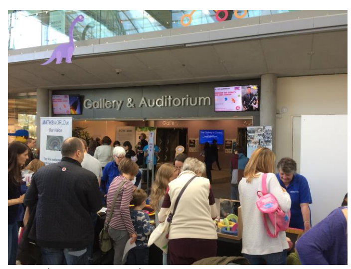
Norwich Science Festival

We wish to thank all the many volunteers (up to 12 at Norwich) who gave freely of their time and helped out at all these fairs.