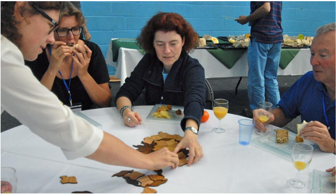
Delegates enjoying mathematical puzzles at MATRIX