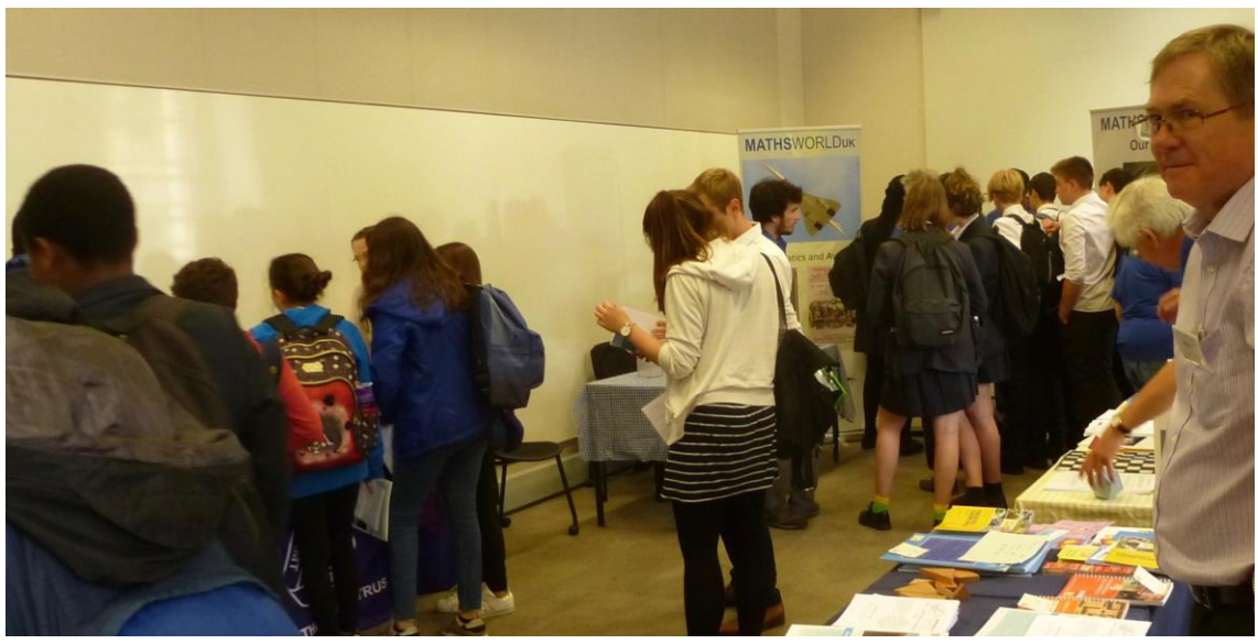
Greenwich Maths Fair