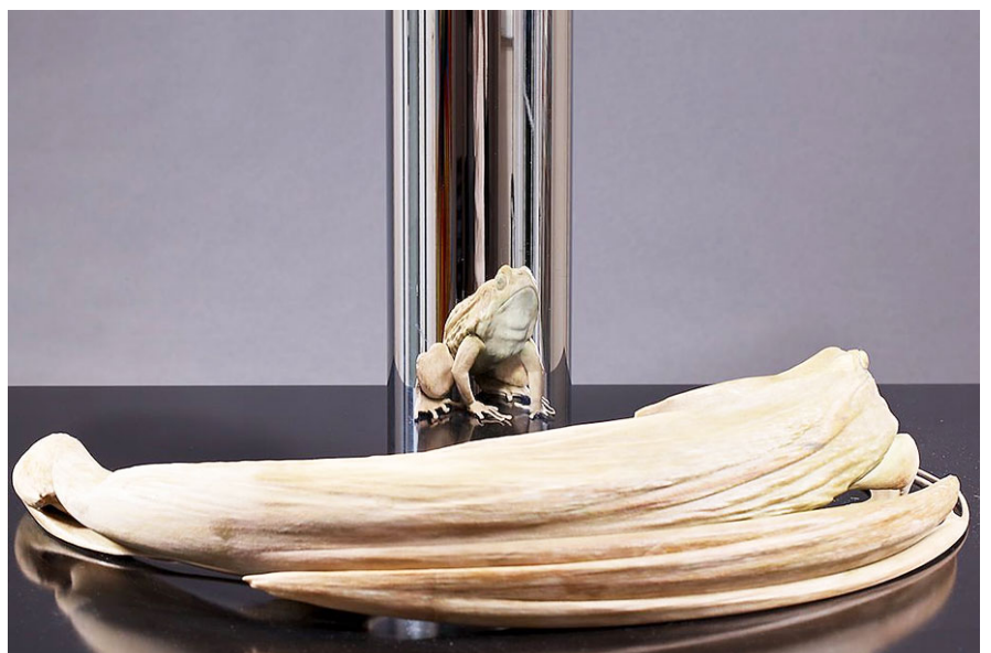
Anamorphic frog sculpture by Jonty Hurwitz

You might find that the real shape is quite distorted and may not look right when you look at it directly - but it should look right in the mirror. Try looking at only the reflection while you build.