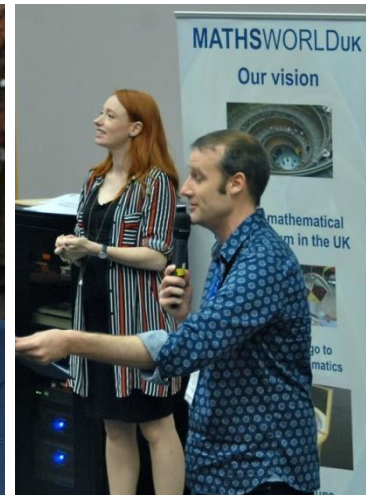
Hannah Fry & Matt Parker