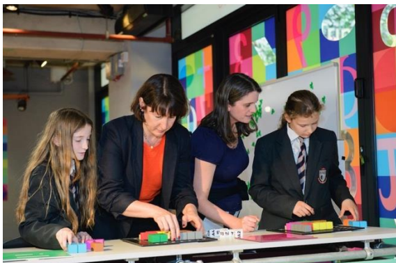
Rachel Reeves at MathsCity, July 2023