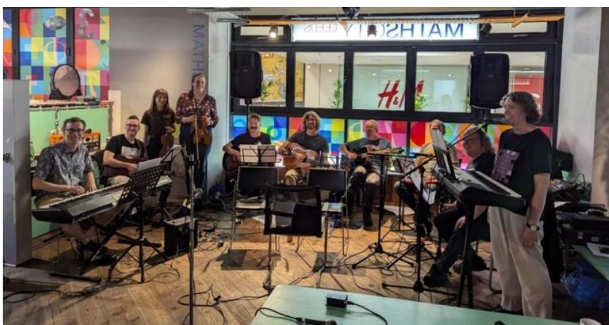
Maths Music Night in MathsCity